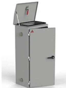
Irrigation Control Panel Enclosure