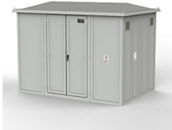
Custom Made Kiosk