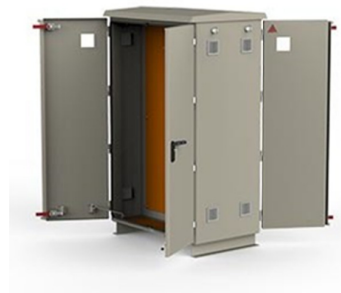
Multi Door Enclosure