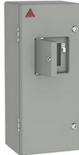
Water Meter Enclosure