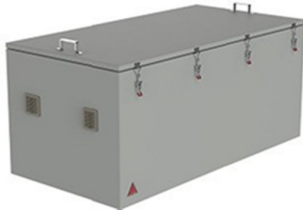
Single- piece Molded Design

Top-lid design with detachable or hinged option, along with options in ventilation, racking and acid drainage.