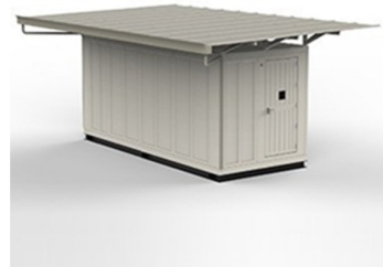
Custom Made Kiosk