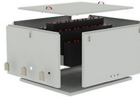
Multi-piece Modular Design