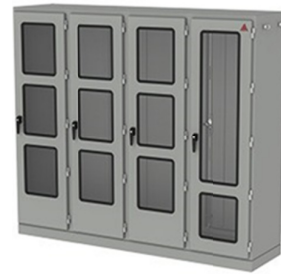
Drop Over Multi-door Custom Made Enclosure