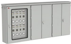
Multi-door Custom Made Enclosure