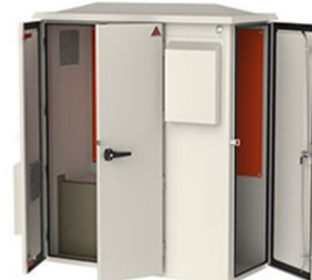
SCADA System Enclosure