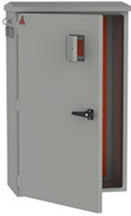
Bulk Metering Enclosure