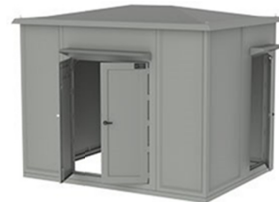
GRP Kiosks IP55