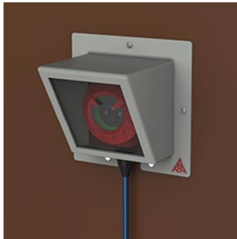
Wall Mounted Detector