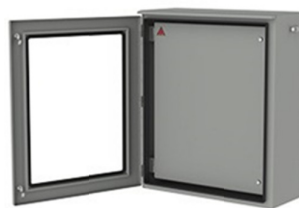
Single Enclosure with Internal Door