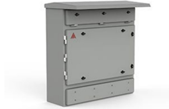
ADSSC Junction Box