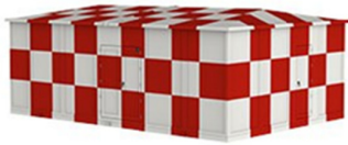
Dubai Airport Kiosk