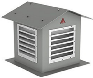
Valve Housing Drop Over Design