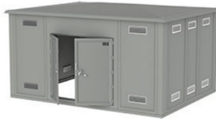
Package substation Kiosks