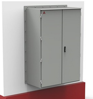
Wall Mounted Enclosure