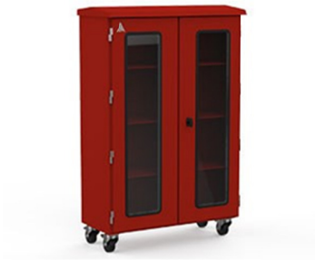
Mobile fire cabinet