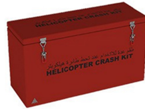
Safety Cabinet (HELICOPTER-CRASH- KIT)