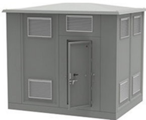
Capacitor Bank Kiosks

Modular construction with the design flexibility to vary access doors, height, width and depth. Utilized in outdoor application of HV/LV and MV/LV distribution systems; the product ranges from substation kiosks, IP55 kiosks, shelters and capacitor banks kiosks. Manufactured in fire retardant grp material with corrosion resistant hardware.