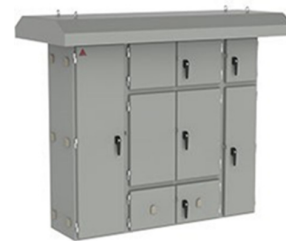
ADWEA system enclosure