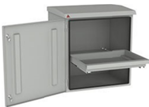
Enclosure with Sliding Drawer