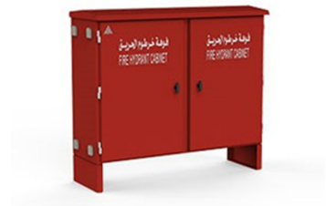
Multidoor Fire Cabinet