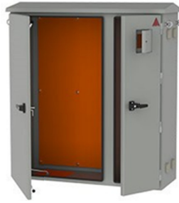
Area Metering Enclosure