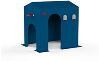
GRP Dropover Enclosure