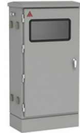
Single Enclosure with Viewing Window