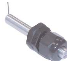
150063 APJ-1 Thru-Fitting plastic fitting with lock nut, sealing nut and hub 1.17" x 0.59" (29.7 x 14.99 mm) PG-7 thread