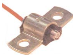
150064 micro Omega clamp metal clamp with rubber cushion for mounting 1.81" x 0.78" (45.97 x 19.81 mm)