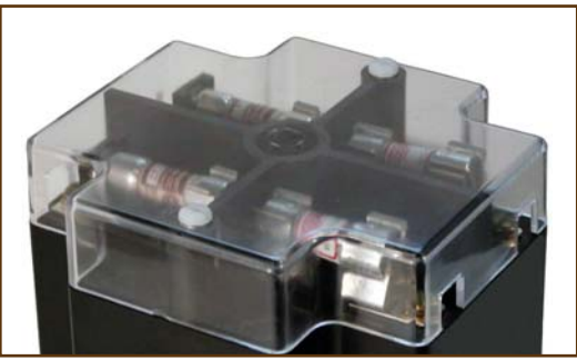
Clear Plastic Cover